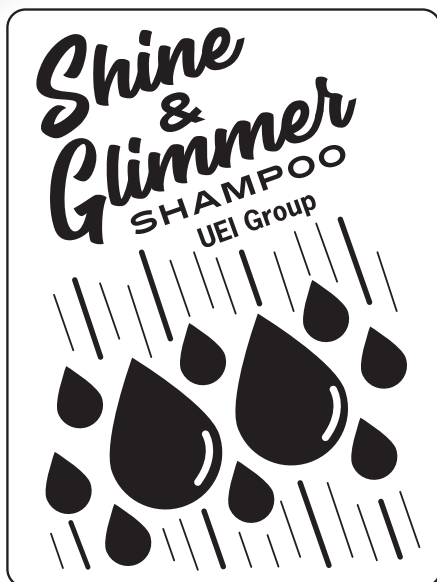
ORIGINAL FILE ART